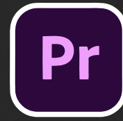
Adobe Premier Pro