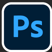
Adobe Photo Shop CC 2021